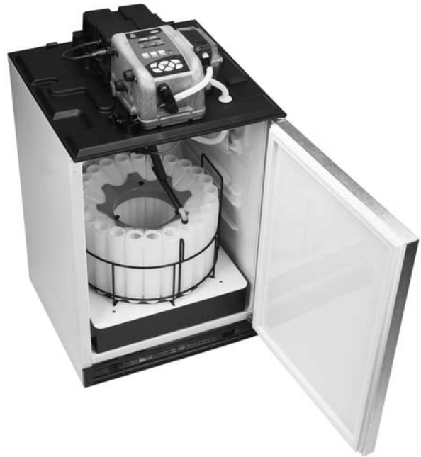
The Hach Sigma SD900 Indoor Refrigerated Sampler is easy to set up and program, delivering reliable results and reduced maintenance.